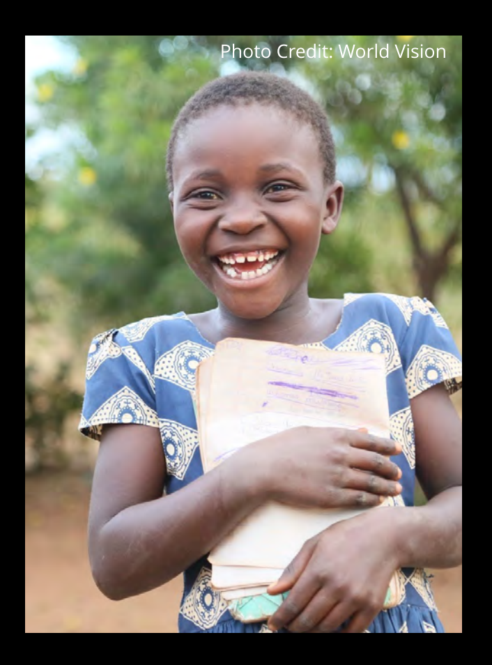
Goal 4: Maintain an Organization Positioned for Leadership

BEC remained positioned for leadership by maintaining financial security (adding five new members in 2022), empowering BEC members as leaders and advocates (via conferences, webinars, consultations, working group exchanges, and advocacy), strengthening strategic communications (e.g. developing a communications and advocacy strategy, linking communications content with BEC's advocacy agenda, etc.), and continuing to foster strong partnerships (e.g. the GRN, USAID, UNICEF, GCE, USGLC, and others).